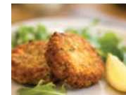
mini crab cakes